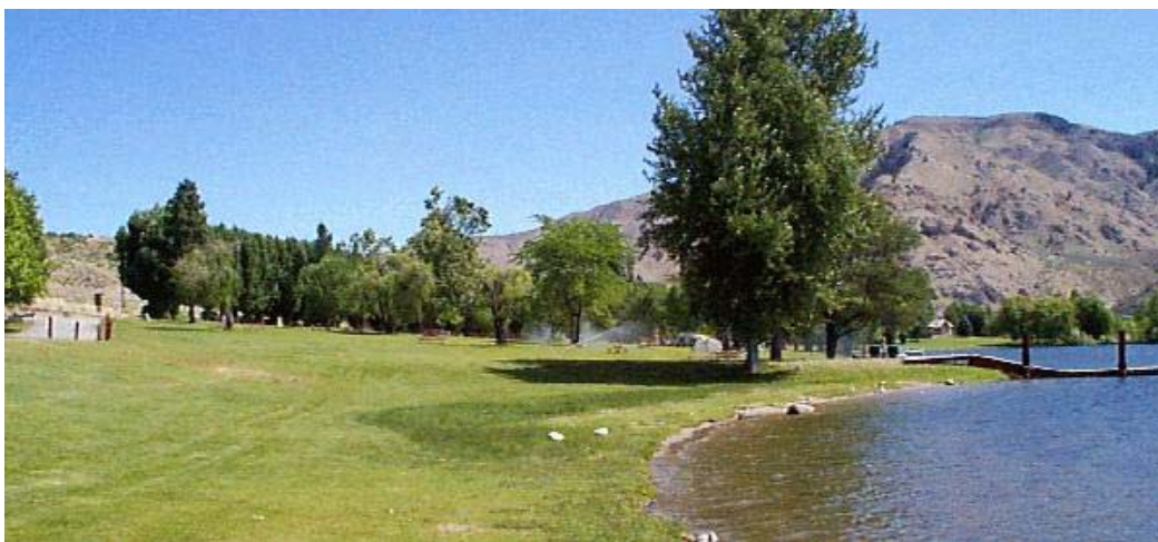
Entiat's loveliest attraction, its waterfront park on the sandy beaches of Lake Entiat, is nestled almost out of site from drivers on Hwy. 97A. .

Entiat Holiday Bazaar – founder & organizer from 1989–present. Entiat Valley Chamber of Commerce – President, Treasurer, Secretary, and member since 1985 Spirit Award recipient 1989, 1990, 1997 & 2000 Entiat Valley Dollars for Scholars Foundation – Co-founder & Treasurer – 1994-present Entiat Valley Royalty Association 1994-2001 City of Entiat Park Advisory Board – Chairperson, Member – 1995-2001 Make a Difference Day – organizer/volunteer – 1994-present Entiat Boys Scouts – Troop 16 - Assistant Scout Master/volunteer – 1990-1995 Rubber Duck Regatta – organizer – 1994-2002